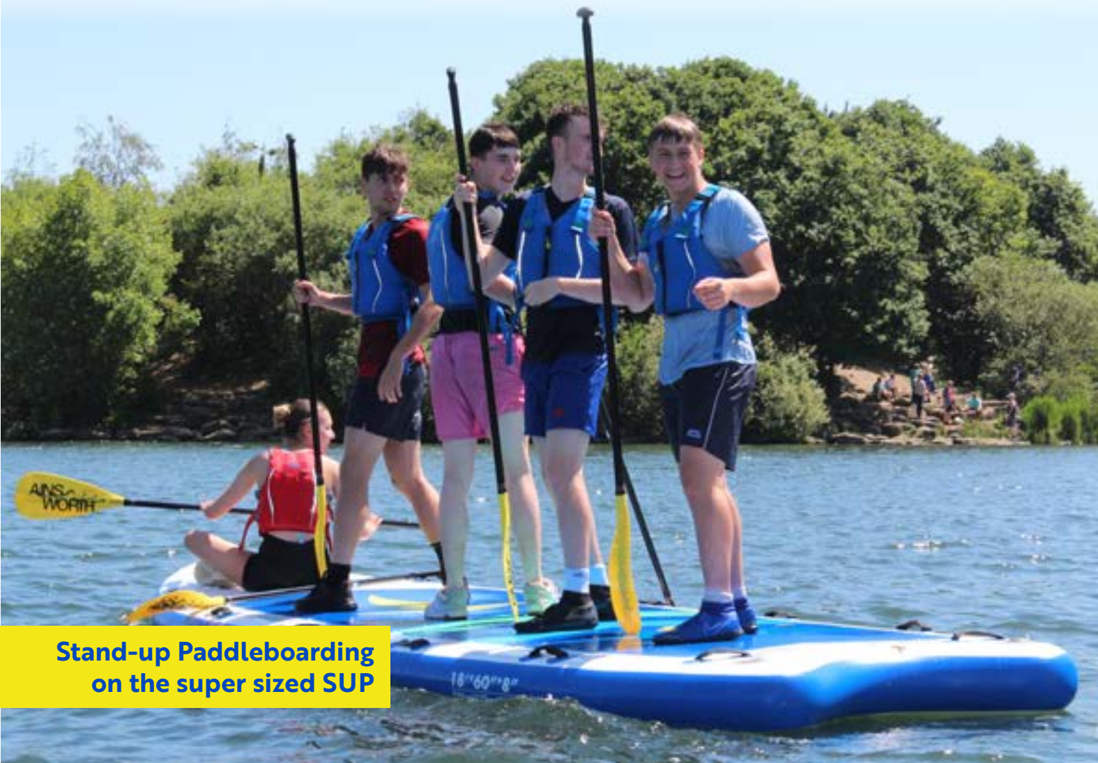
Stand-up Paddleboarding on the super sized SUP

Contact us today using the interactive form at the back and we can get back to you with a bespoke quote - it may not be as expensive as you think!