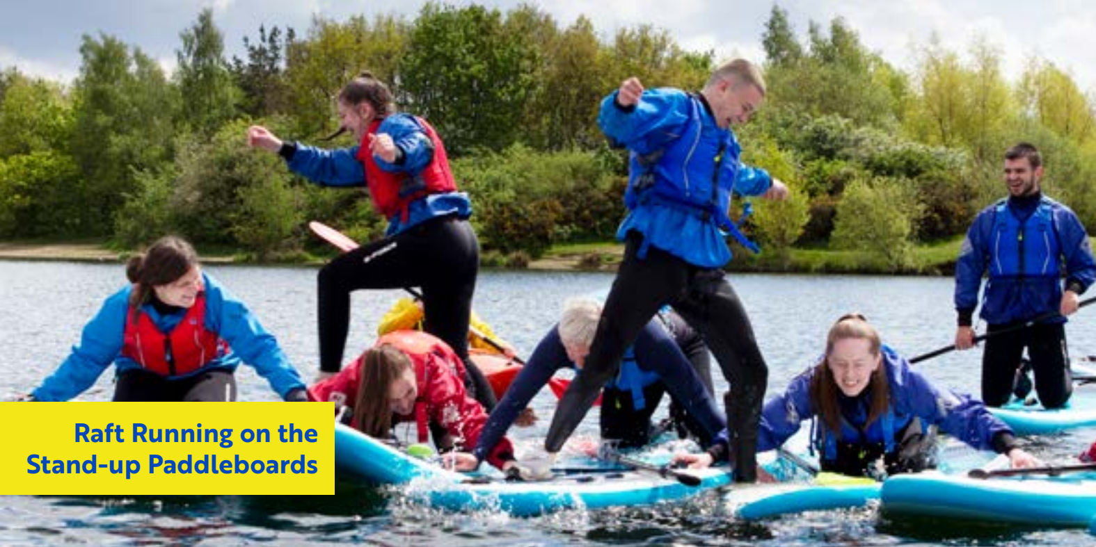
Raft Running on the Stand-up Paddleboards