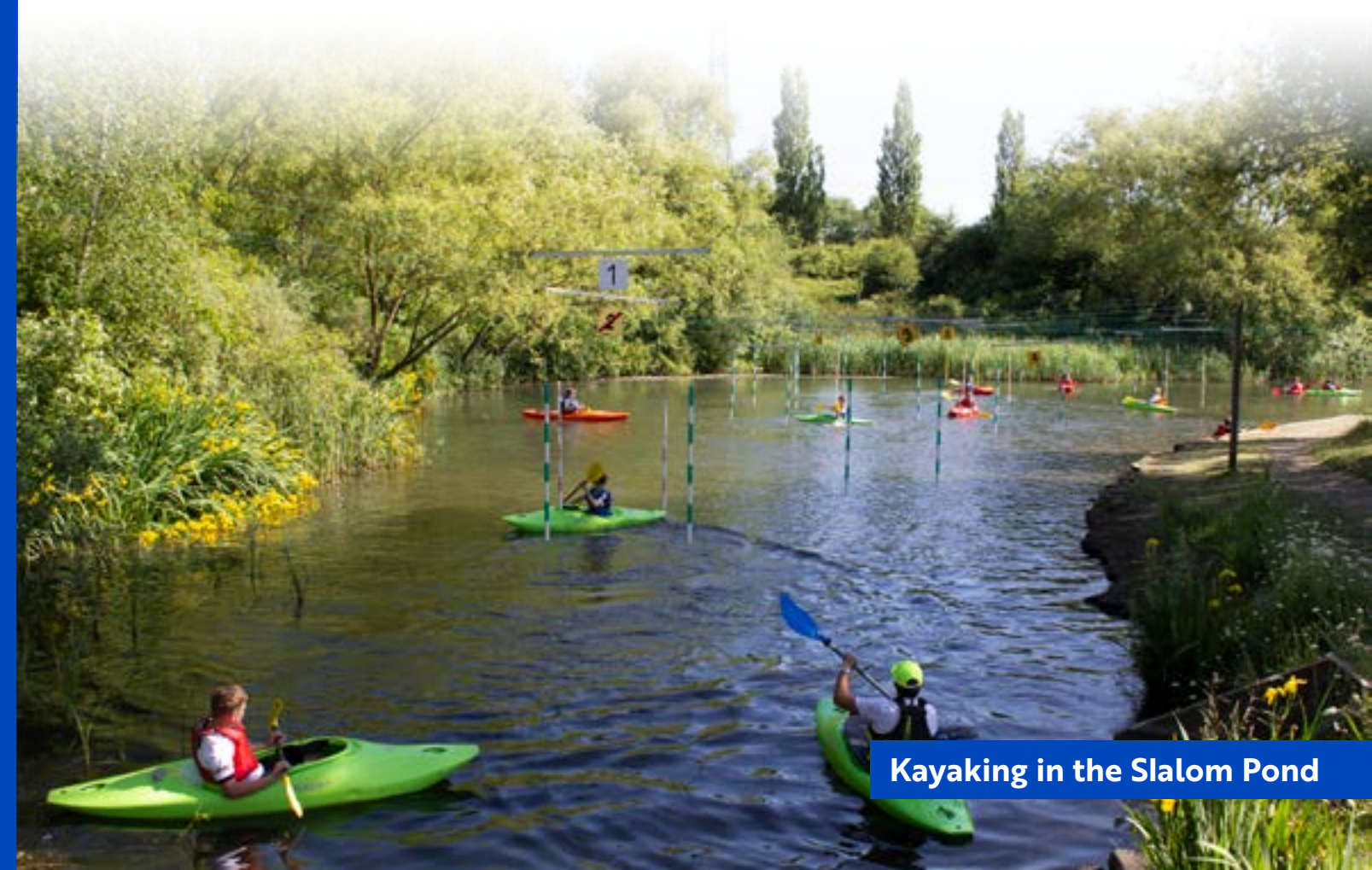
Kayaking in the Slalom Pond

Improvements and development in personal and social skills, independence, resilience and team work are amongst a few. Improvement in physical health and mental wellbeing come hand in hand with this.